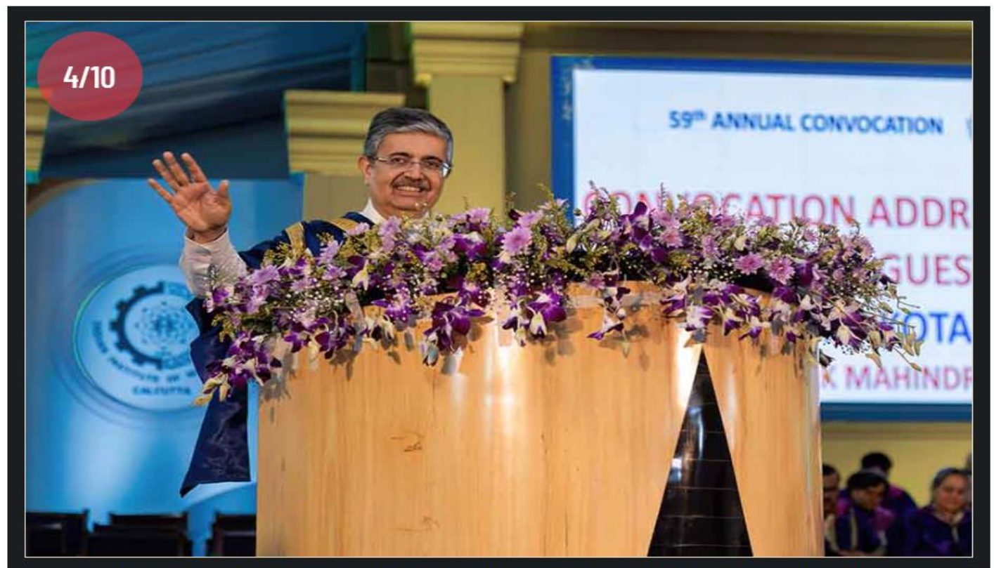
Uday Kotak addressed graduating students at IIM Calcutta's convocation, imparting wisdom and insights for their future endeavours