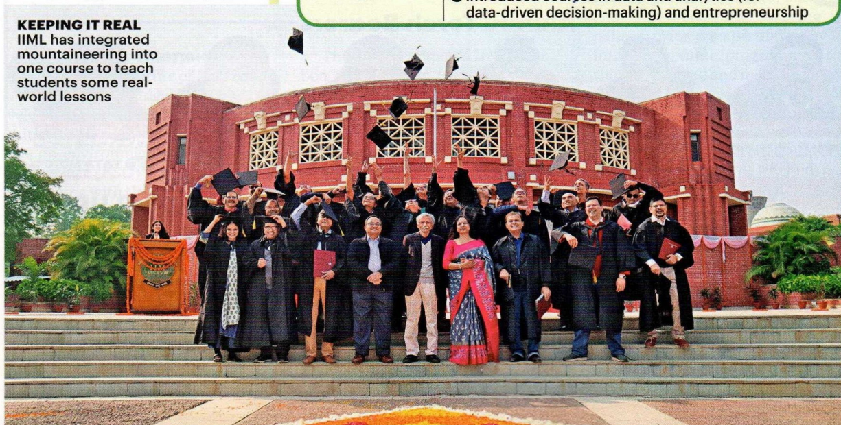
KEEPING IT REAL IIML has integrated mountaineering into one course to teach students some real-world lessons