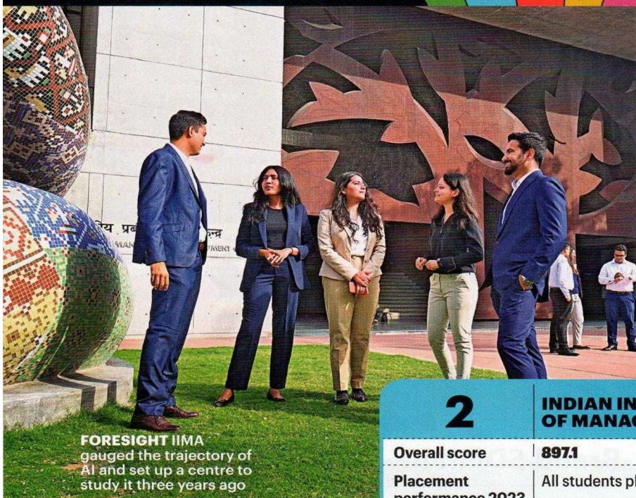
FORESIGHT IIMA gauged the trajectory of AI and set up a centre to study it three years ago