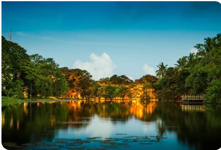
The programme concludes with a three-day campus session. IIM Calcutta