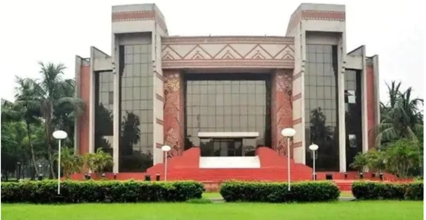
IIM Calcutta.

Indian Institute of Management Calcutta has introduced an Executive Programme in Business and Corporate Laws for working professionals who have an active interest in understanding the legal aspects of business, especially in today's dynamic times.