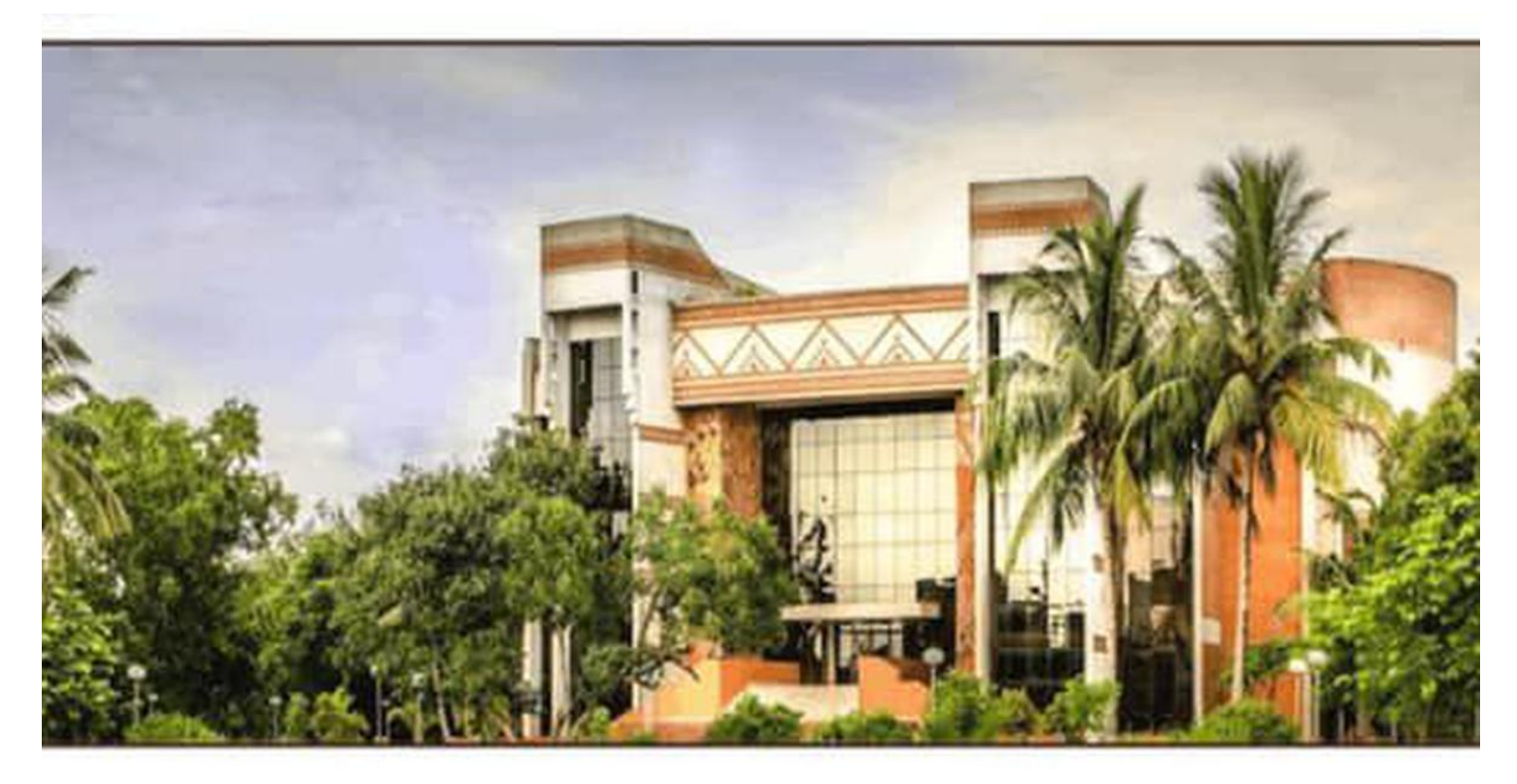
A file photo of the IIM-Calcutta building.

The faculty association of the Indian Institute of Management, Calcutta, on Thursday wrote to the Centre, expressing concern that the proposed regulations for the institute overlook its academic legacy and will hurt its autonomy. The faculty members brought to the Centre's attention the "proposed misappropriation" of the IIM Act by the institute's Board of Governors.