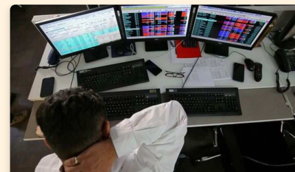
Stocks to Watch: Adani Ports, BEML , Just Dial, LIC, Muthoot Finance