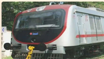
Tata, Mahindra, Ashok Leyland eye BEML stake