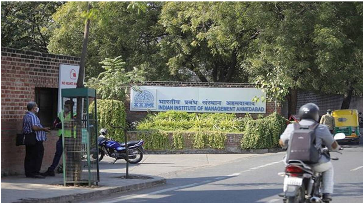
IIM Ahmedabad ( Express Photo by Nirmal Harindran/Representational)